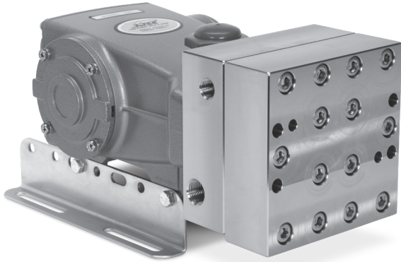
Model 781 Shown (Mounting rails sold separately)