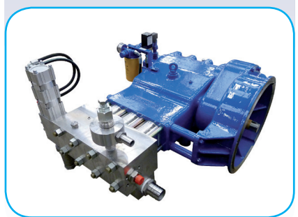
Pump fitted with 1000 bar pumphead

• Conversion kits for High Pressure (HP)